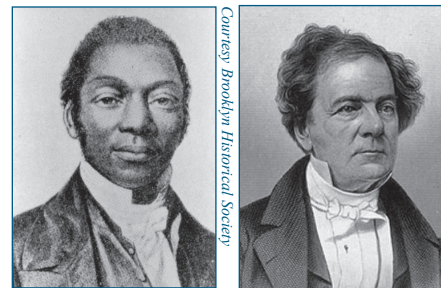
James Pennington (l) and Lewis Tappan, abolitionists whose lives entwined in Brooklyn

Lewis Tappan, a successful white merchant, was born in New England but lived most of his life in Brooklyn Heights. His mercantile credit agency eventually became the well-known rating firm, Dun & Bradstreet. Beginning in the 1830s, Tappan devoted his fortune and time to fighting slavery, backing anti-slavery newspapers and the American