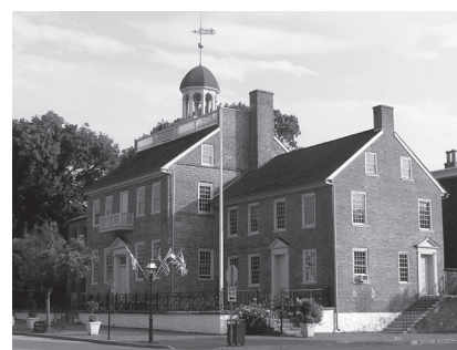
New Castle Court House, a National Historic Landmark listed in Delaware's CHRIS system

synagogue has been home to three different immigrant congregations: two Jewish and one Lithuanian Catholic. The exhibit examines how the three groups used the building and how recent archaeological explorations have revealed the ways the site has changed over time. The Synagogue Speaks is one of several projects marking the Museum's fiftieth anniversary in 2010.