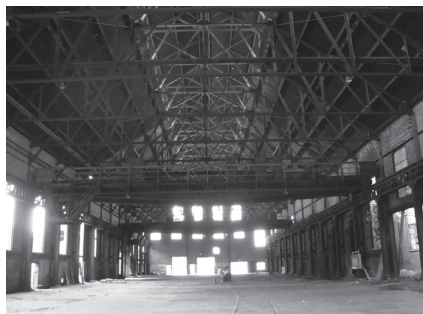
Interior of Number 8 Hammer Shop

The Number 8 Hammer Shop , an original Bessemer converter building dating to the 1870s and located on the historic portion of the Bethlehem Steel site in Bethlehem, Pennsylvania, was razed on January 22,