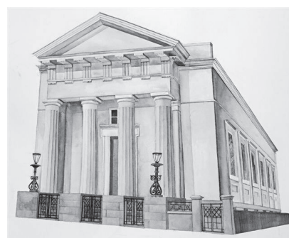
Baltimore Hebrew Congregation at Lloyd Street Synagogue, 1845

The Synagogue Speaks, a hands-on exhibit at the Jewish Museum of Maryland's restored Lloyd Street Synagogue, opens on March 21st. The 165-year-old