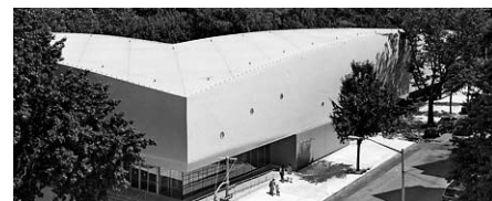
The newly expanded Brooklyn Children's Museum

Washington-Rochambeau Revolutionary Route (W3R-USA), for which she is national chairman. W3R-USA is a 685-mile stretch of road along the Atlantic coastline marking the route walked by the allied French and American soldiers during the American Revolution in route to Yorktown, Virginia, where their capture of the British army essentially ended the war in the Americans' favor.