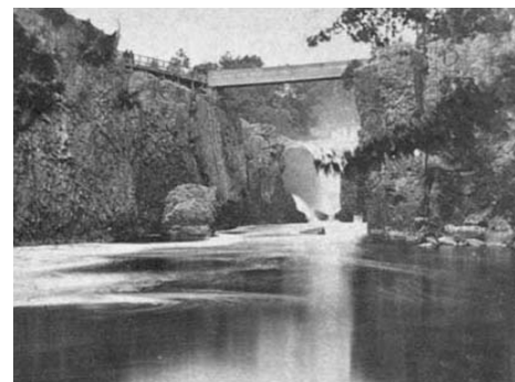
Patterson New Jersey's Great Falls, c. 1900

a recent shoot at the former Cambria Iron Company blacksmith shop recorded a re-enactment of a test of the Kelly converter, a major innovation in nineteenth century steel manufacturing. The theater in which the film will be shown will have heat projectors and vibration transducers under the seats to give viewers the feel of being inside a working steel mill.