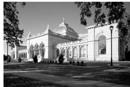
Please Touch Museum in Memorial Hall; 2008.

Two landmark children's museums in the Mid-Atlantic have dramatically increased their capacity in recent months. In September 2008, the Brooklyn Children's Museum , the first museum created expressly for children, opened its new