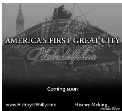
Construction of Broad Street Railroad Station, 1890.